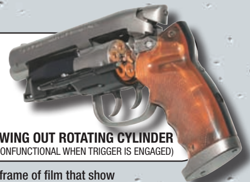
SWING OUT ROTATING CYLINDER (NONFUNCTIONAL WHEN TRIGGER IS ENGAGED)

Prop replica comes with the original round slot head screw, as after much research of every frame of film that show the right hand side of the prop, it was found and proved that the Weaver knob was added to the prop post-film.