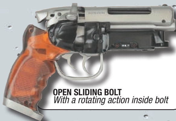
OPEN SLIDING BOLT With a rotating action inside bolt