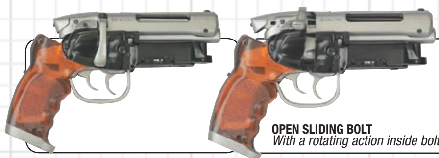
OPEN SLIDING BOLT With a rotating action inside bolt