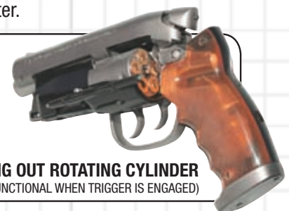
SWING OUT ROTATING CYLINDER (NONFUNCTIONAL WHEN TRIGGER IS ENGAGED)

This Prop Replica comes with the original round slot head screw, as after much research of every frame of film that show the right hand side of the prop, it was found and proved that the Weaver knob was added to the prop post-film.